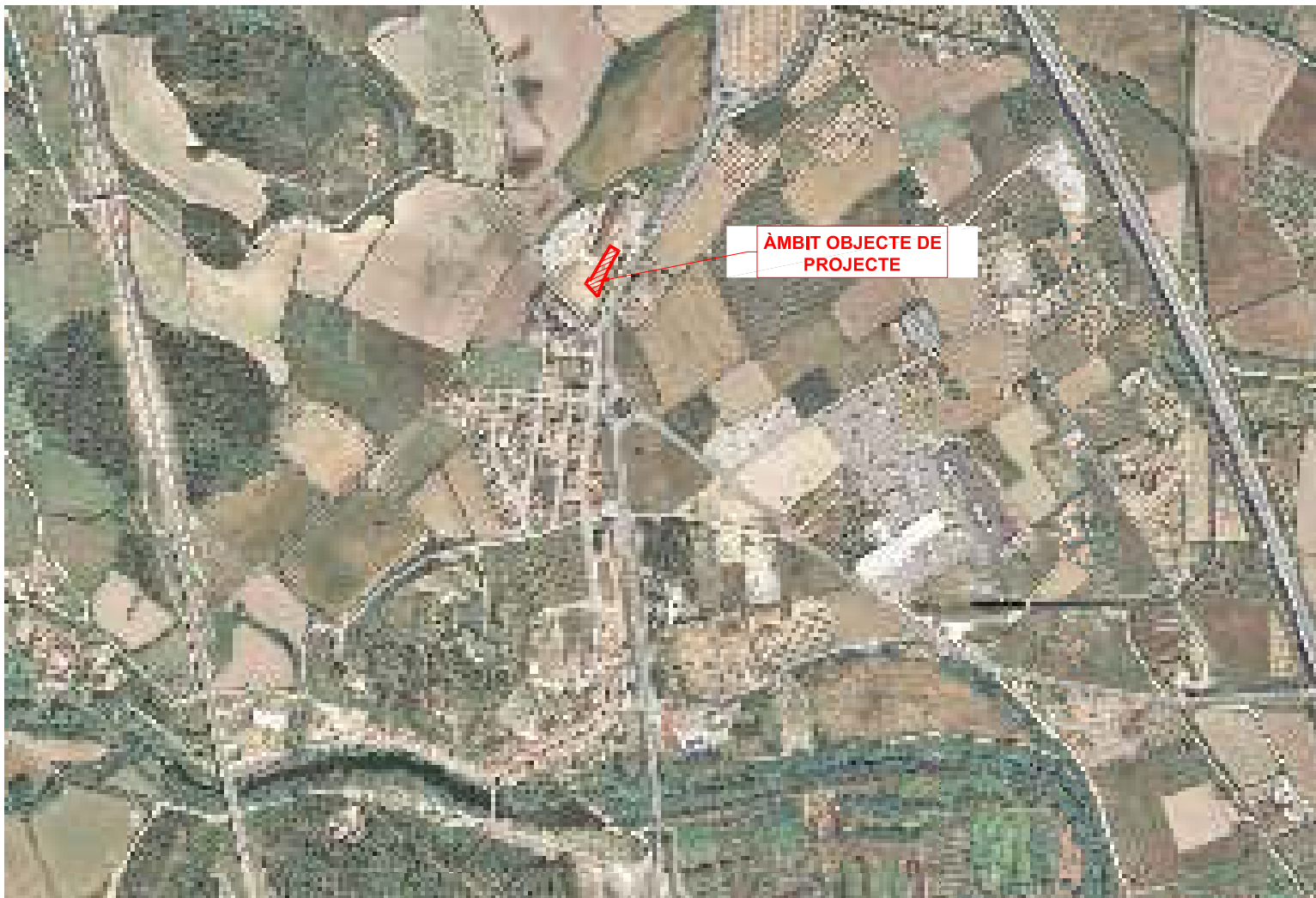
SITUACIÓ E: 1/5.000 (DIN A1) - 1/10.000 (DIN A3)