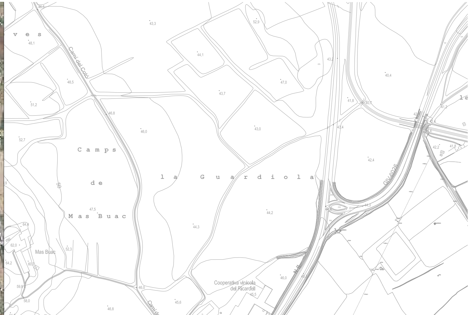
EMPLAÇAMENT E: 1/2000 (DIN A1) - 1/4000 (DIN A3)